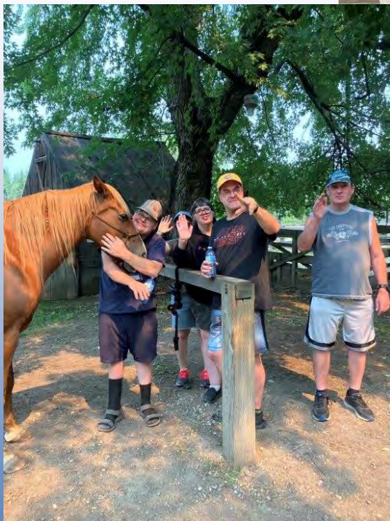
Horsing around at Harding Ranch