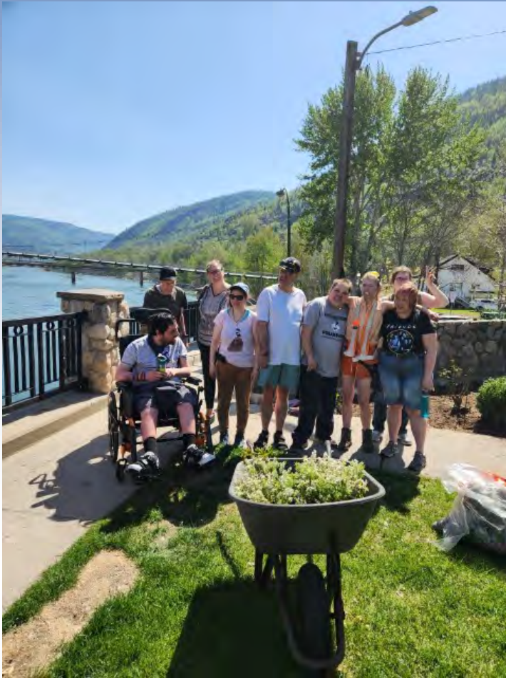
Participants from the Day Program volunteering with Communities in Bloom.